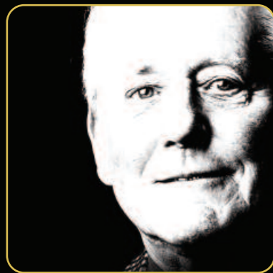
from Jim Marshall OBE

For over 40 years the Marshall name has been synonymous with the greatest guitar tones in music. We have worked hand-in-hand with guitarists of all levels throughout the world to maintain and improve that special ingredient, 'The Marshall Sound.'